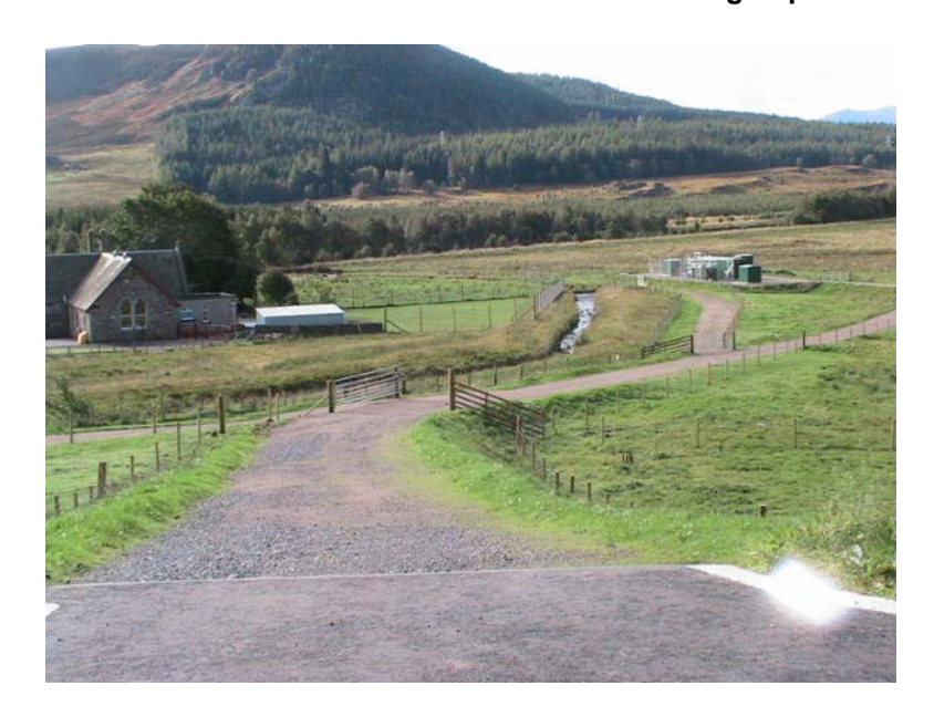
Fig.3. Access Track and Borehole Compound Viewed from Public Road Looking South.