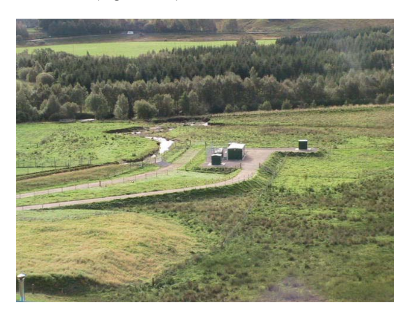
Fig. 2. Access Track and Borehole Compound Viewed from Public Road Looking South.

6. This application refers to the formation of the access track on the south side of the public road and the borehole compound. The works here include the 3 metre wide track, which is constructed at varying heights above the existing ground levels (maximum 1.8m) and which has graded edges. At the junction with the public road, there is a layby and tubular steel gates with stock fences. The borehole compound, which is also above original ground levels by approximately 1m, is surrounded by a metal security fence. Within the compound are 3 borehole kiosks, a chlorine contact tank, a water treatment works room and a control room, and an inlet tank. Above ground equipment is coloured dark green. Within a wider area of ground around the compound, and within stock proof fencing are areas proposed for screen planting. Some screen planting is also proposed along the west side of the new access track. An existing agricultural access and track on the east side adjacent to the Gergask Burn is to remain for the use of the landowner. (Figs. 2 & 3).