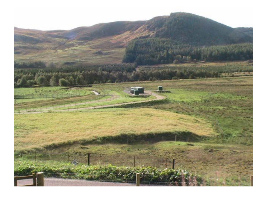
Fig. 5. Deposited Excess Material in Foreground

8. This application refers to the unauthorised depositing of excess ground material excavated from the works to create the access tracks, the borehole compound and the clear water tank. As a temporary measure, this material was deposited in a natural hollow lying to the north west side of the borehole compound. It became evident to the applicants that if this excess material were to be transported off site, it would require to be taken to a licensed landfill site in Perth. It was considered by the applicants that there would be considerable environmental impacts from this (300 lorry loads approximately) and further to discussions with the landowner, it was decided that the material could provide an agricultural improvement at the site. As such, the applicants now seek a permanent permission for the depositing of this excess material. The area in question amounts to approximately 2,582 square metres. The material raises the ground levels in the hollow by approximately 1.6m. (Fig. 5)