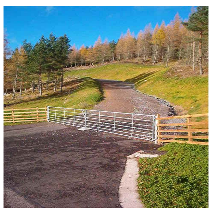
Fig. 6. For information – Unauthorised Access Track