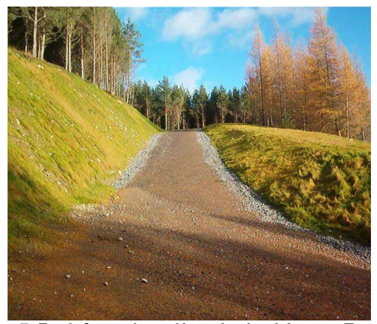
Fig. 7. For Information – Unauthorised Access Track