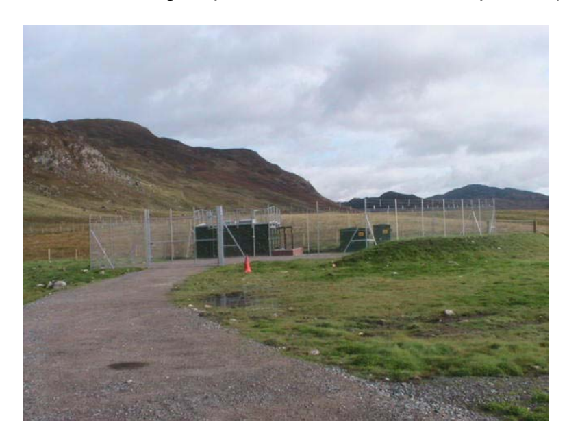
Fig. 4. Clear Water Tank Compound Looking East

7. This application refers to the formation of the clear water tank compound on the elevated and open north side of the village above the woodland. The compound is enclosed by a 3 metre high metal security fence. Within the compound, there is the clear water tank, a glass reinforced instrumentation and power kiosk and a flow meter chamber. All above ground plant is coloured dark green. Outwith the compound but within the red line site boundaries, is a bund which it is proposed to plant. A steel access gate provides access to the compound. (Fig. 4.)